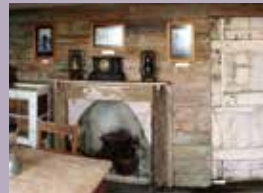
CHART ROOM AND MCBRIDE HUT